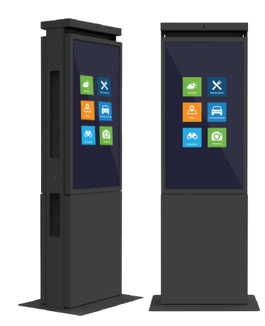
For More Information