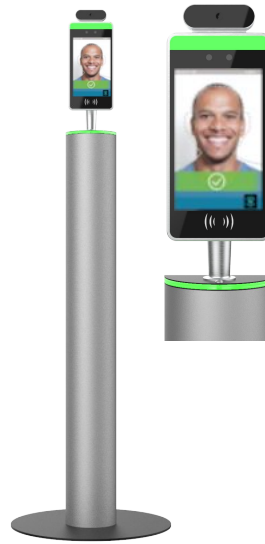
Pedestal w/ LED